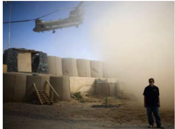
A US contractor looks away from a dust cloud whipped up by a helicopter departing over a gatepost Kandahar, Afghanistan, 2010.

The elements of the altered strategy in Iraq included: securing and serving the population; living among people; promoting reconciliation; fostering Iraqi legitimacy; building relationships; being first with the truth; and 'living the values'. All of these changes are part of a classical counter-insurgency strategy and even though they sound simple, implementing them in a hostile environment is easier said than done.